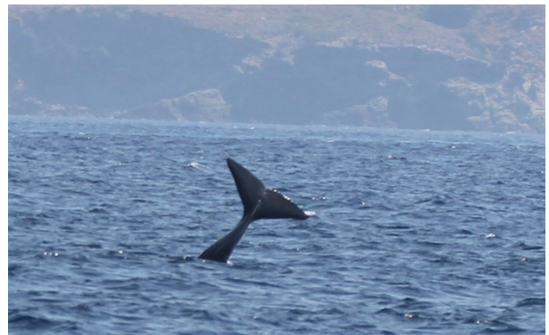
Fig. 2. P. macrocephalus recorded on 02/09/2019 in the North Ikaria Basin.

From March 2017 to October 2019, a total of 7 P.