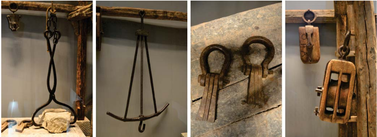
Fig. 1. Historical tools displayed in the Museo dell'Opera del Duomo. From the left: pincers, turnbuckles, three-legged lewis, pulleys.

on the drum, keeping the structure stable in all the construction phases [1];