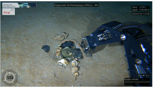
B. Half amphora buried in the sand