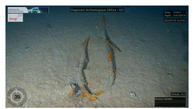
E. Cable loop partially buried