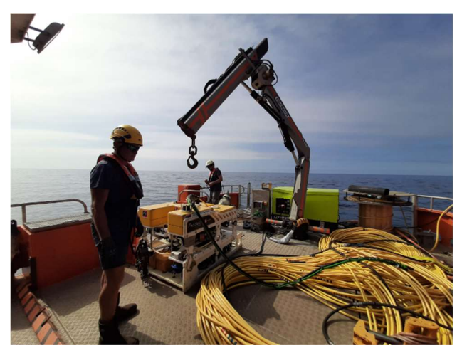
Fig. 2: deployment of the ROV on board