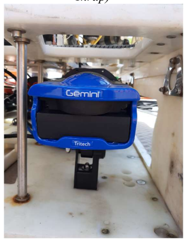
Fig. 3: Gemini 720is acoustic camera, positioned at the front of the ROV

This mission, carried out over 11 days<sup>5</sup> in July 2022, covered the 50 km route, over a corridor 30 m wide (circa 1 502 000 m2) and between 100 and 500 m deep. The ROV used was a Perseo-GTV (Copetech-SM), equipped with an