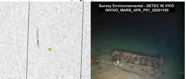
Fig.1: Anomaly identified on the low acoustic data of the initial survey and its visual correspondence during the Rov survey of Setec In Vivo.

However, analysis of the data also revealed that the specifications of the acoustic survey were not sufficient for an archaeological reading, that gaps in the coverage left areas of invisibility and finally that the ROV's field of view did not give an overall view of the right-of-way on either side of the cable route (Fig. 1).