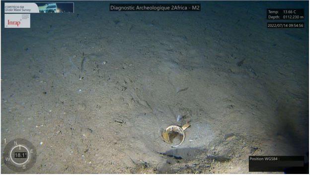
C. Recent coffee cup buried