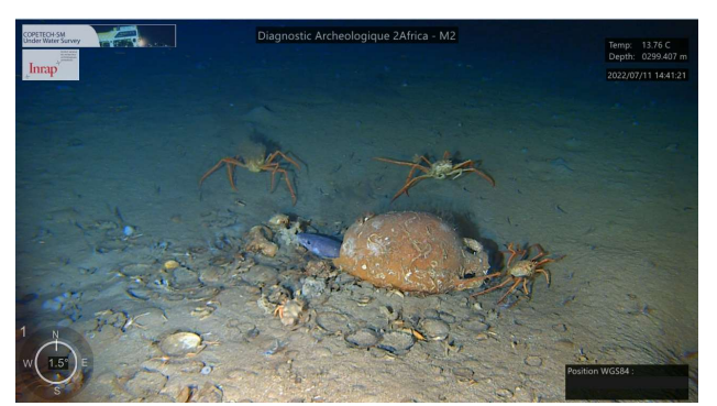
A. Amphora Almagro 51c laying on the seafloor

This first experiment clearly demonstrated its relevance for systematic surface detection, preferably on a regularly sloping seabed. The configuration of a narrow linear rightof-way lends itself perfectly to this type of investigation, but the method could also be transposed to wider right-ofways by carrying out a survey using successive transects. Concerning the duration of the fieldwork, the ratio is satisfactory in comparison with the cumulative time required for the SSS acoustic survey, processing and analysis of the data, followed by a survey by diving in situ. Certain improvements or additions to the installation and settings of the acoustic and optical cameras could make it even easier to adapt this protocol to other contexts. In the very near future, we plan to extend the application of this protocol, which combines a systematic acoustic survey with an expert assessment, to freshwater, in lakes or rivers, or other contexts with severe constraints other than depth (turbidity, pollution, pyrotechnic risk, etc.).