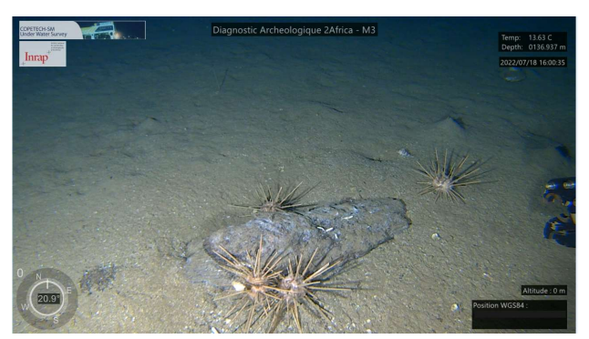
D. Small piece of wood