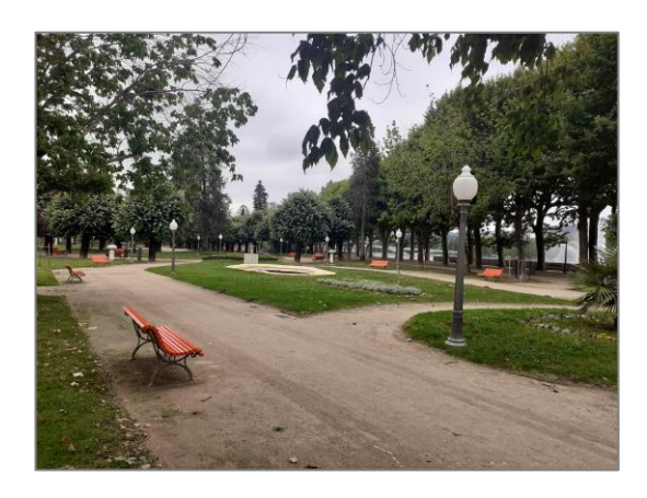
Fig. 2. Manuel Braga Park (2023)

Unlike the Manuel Braga Park, where the plant component was very important, in the case of Terra Nostra Park, the intervention has mainly focused on upgrading the park organization, structures and facilities. The Park House was remodelled and turned into a villa – the Botania Hall, and the whole park entrance area is being reorganised; the conversion of changing rooms, canteen and workshop room, the acquisition of signage and visitor support equipment, and the installation of a new shop and night lighting in the park are still part of the project [23].