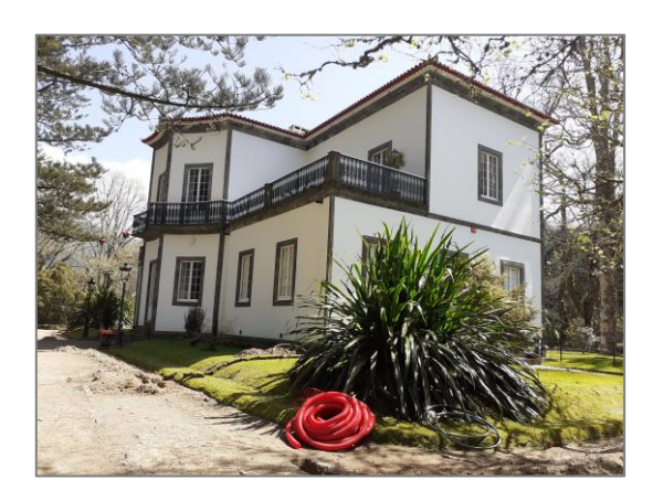
Fig. 3. Terra Nostra Park – Park House (2023)

The Quinta do Monte project will largely target the restoration of the building that will house the Romanticism Museum, with works also planned in the garden. In Alta Vila Park it is important to draw attention to the work done to incorporate it into the existing urban space, having proceeded to eliminate the barriers that isolated it. Regarding the Leiria Castle Park and the Quinta do Castelo, it is important to highlight the relevance of the